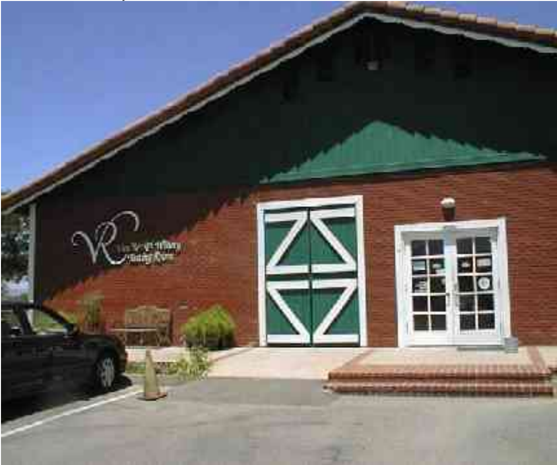
Van Roekel Winery Photos:

Book your limo now at: www.all-star.tv 2006 © Copyright All Star Limousine Inc.