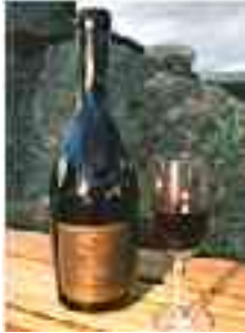
Ponte 2003 Zinfandel Port

Nothing says romance like a glass of Ponte Port. At almost 20% alcohol it is the perfect ending to a romantic evening.